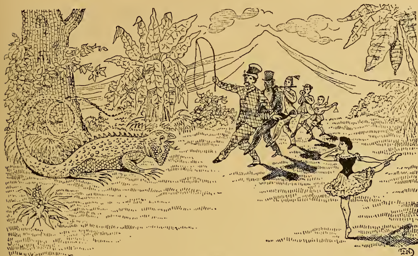
HUNTING THE IGUANA.

beasts, who would crush us if they trod upon us while we were sleeping on the ground. We should be safe from them at any rate.